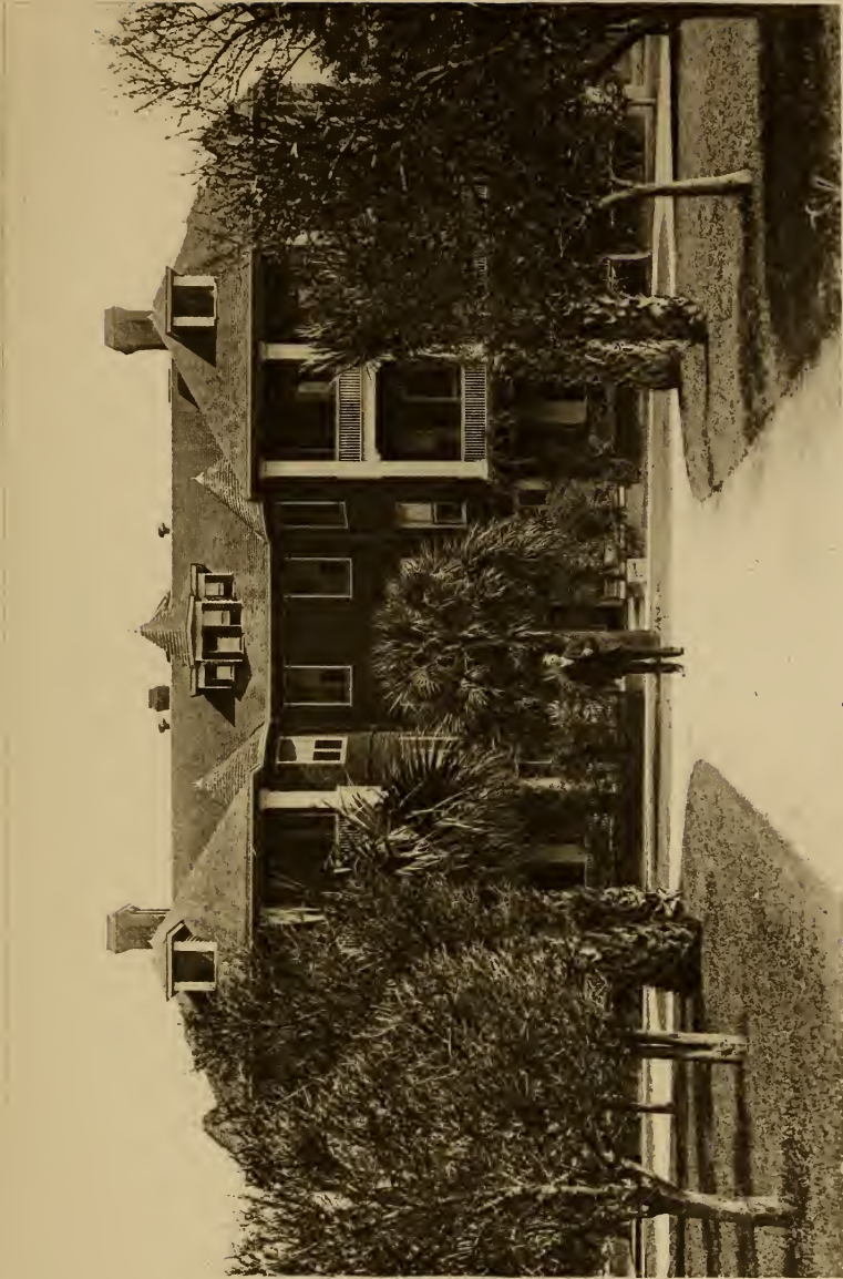
"SANS - SONCI" APARTMENTS